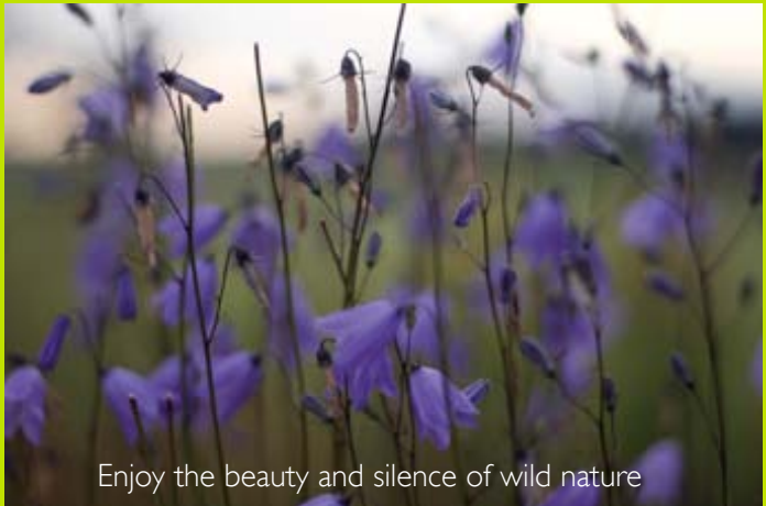
Enjoy the beauty and silence of wild nature

Discover the Joy of your Being and let it flower!